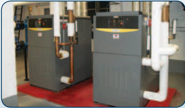
A scene of the street being dug up for the new gas line to the building (above). The new boilers (below).

tos present. The next hurdle would be getting ConEdison to provide the new gas service to the building for the boilers. Gas service existed for cooking, but it was insufficient to accommodate the new boilers. This would turn out to be the most difficult part of the project. Once the gas main was identified in the street as being of sufficient capacity, ConEdison had to determine a new point of entry (POE); once this was done, the heating contractor could plan the layout of the gas piping from the boiler room to the POE.