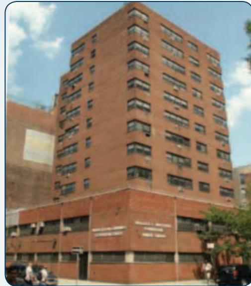
179 Henry Street, New York, New York.

New York City is filled with multifamily apartment buildings built before World War II; we often refer to them as prewar buildings. Of course, many wars have been waged since 1945, so I won't use "prewar" as a description. A common trait of these buildings, however, is that they are heated with steam boilers. Builders didn't stop building multifamily housing with steam heat after the war—steam heat has been as common as hot-water heat in these large buildings for some time. The multifamily building at 179 Henry Street was built in 1965 with HUD financing for senior living. The heating system was designed to provide two-pipe steam heat to the building from two large firebox boilers burning #6 fuel oil. This is how it was in 1965 and through the summer of 2010. (For a snapshot of the building before the retrofit in 2010, see "Prewaterization Stats.")